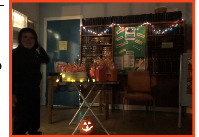
Welcome Table with Treats

We handed out hot chocolate and biscuits, as well as the treat bags, and got to speak to so many people, many of whom were surprised we were open on Halloween! We wanted to meet our community where they are, and that’s exactly what we did.