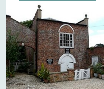
Raithby by Spilsby