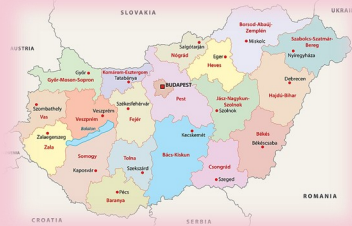
Counties of Hungary

I do not have any family – I enjoy riding my bike and working out at my local gym when I can.