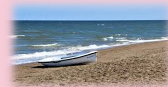
Moggs Eye Beach, Lincolnshire